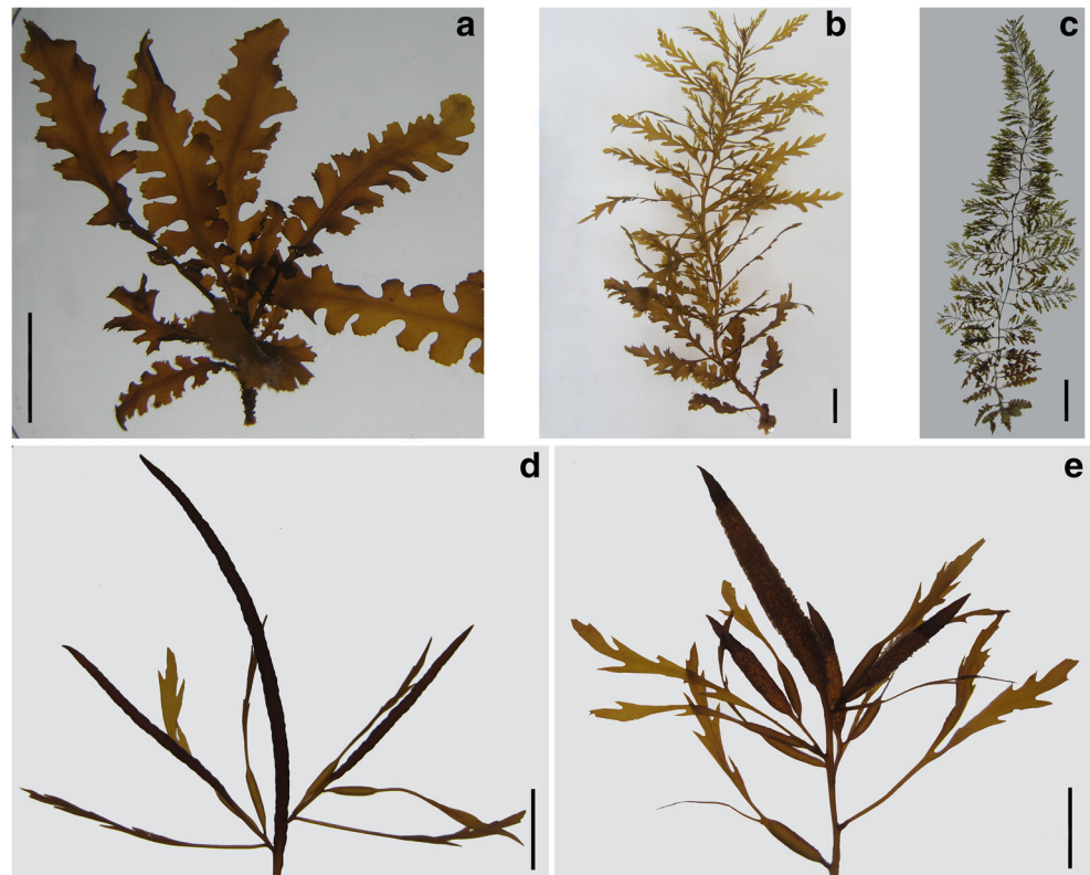
Fig. 1 Different growth phases of S. horneri in laboratory culture. a Young sporophyte (scale bar, 1 cm); b Sporophyte (scale bar, 1 cm); c Mature sporophyte (scale bar, 15 cm); d Male receptacle (scale bar, 1 cm); e Female receptacle (scale bar, 1 cm)

test). The lipid content in S. horneri was assessed by ANOVA. Results are presented as the mean \pm SD. P < 0.05 was considered statistically significant. Analysis was undertaken using SPSS 13.0 for Windows. The lipids (MGDG, DGDG, and SQDG) were identified according to previously described protocols by Wang et al. (2014) and Li et al. (2014). Unfortunately, DGTAs are not commercially available at all, and no previous studies have characterized the location of fatty acyl in DGTA. Therefore, in this report, the distribution of fatty acyl chains in DGTA was characterized according to conclusions drawn by others (Roche and Leblond 2010). In addition, its semi-quantitative analysis was completed according to the ratio of the area of each DGTA molecule to that of its DGTS standard since both DGTA and DGTS are structural analogs.